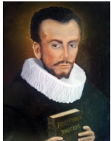
ST EDMUND CAMPION, 1540-1581 Scholar, priest, hero, martyr Feast-day December 1st

The Relic of local Saint St. Edmund Campion will be displayed at the 10am Mass on Sunday 11 th May, when all will have an opportunity to venerate the Relic.